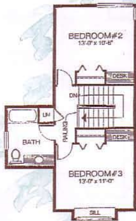
SECOND FLOOR PLAN 507 SQ. FT. (47.1 M 2 )

THIS DESIGN INCLUDES AN UNFINISHED INGROUND BASEMENT